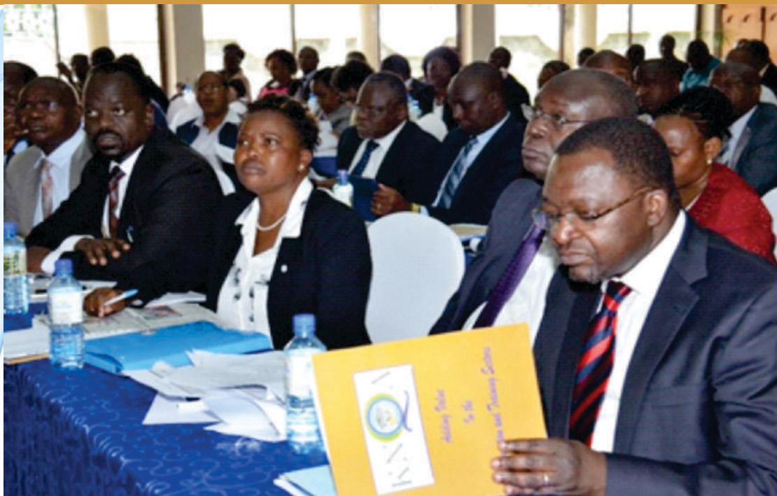
Stakeholders in one of the KNQF consultative meetings, creating a NQF requires a lot of consultation.