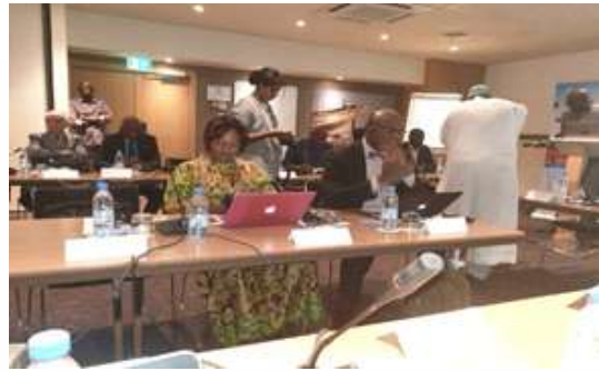
Delegates during Continent wide workshop to develop standards for Quality Assurance and Mutual Recognition of Qualifications in Africa in Dakar Senegal.