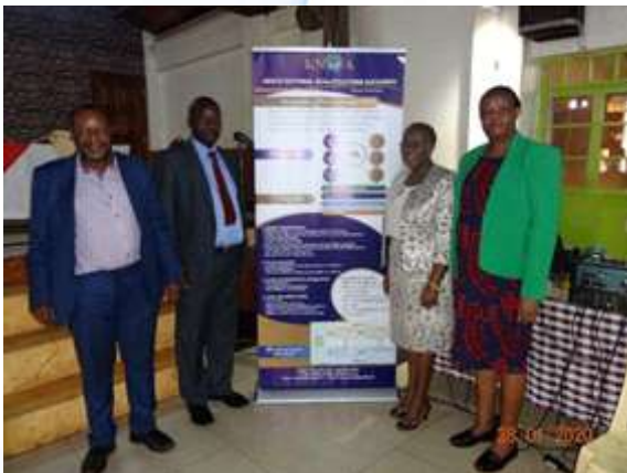
The RPL Policy Technical Committee during the RPL validation workshop at Kabete National Polytechnic.