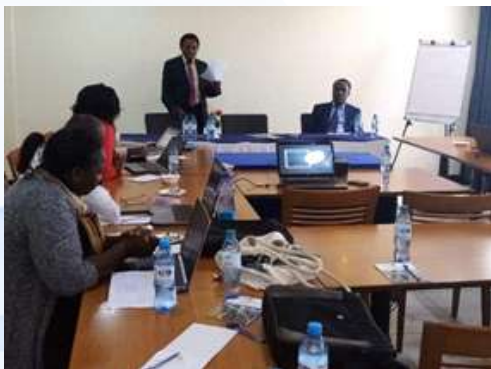
CAS- MoE Hon. Zack Kinuthia addressing the KNQA Team during a strategic plan workshop at Naivasha. The five-year strategic plan aims at making Kenya the hub of Quality, relevant and Internationally competitive qualifications to transform Africa and the world