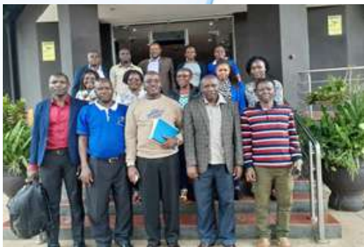
Members of KNQA staff during a workshop to develop training manuals and brochures in Machakos.