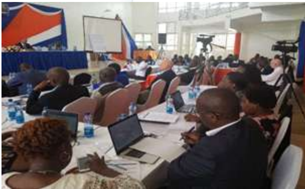
Workshop on Integrated approaches to improve Technical training and Youth Employment in the Lake region at Kisumu National polytechnic. In attendance are; CESs and Cos from the Lake Region, the KNQA, CDACC, TVETA, USAID, GIZ and DFID.