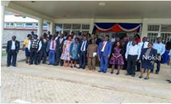
The Western Region CBET Implementation Committee Meeting held at Kisumu National Polytechnic to chart CBET Implementation roadmap in the region.