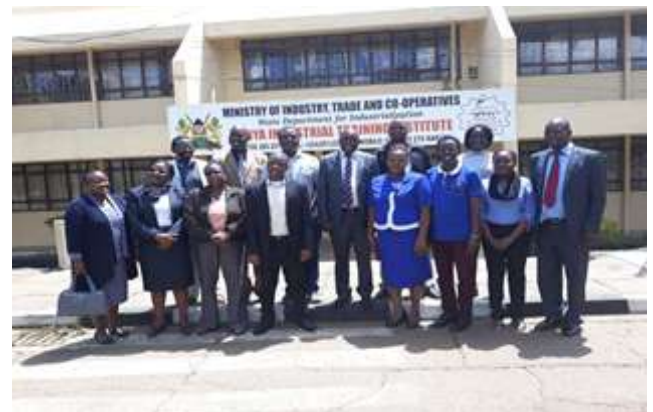
The Recognition of Prior Learning Policy Technical Drafting Committee during the drafting workshop at KITI, Nakuru.