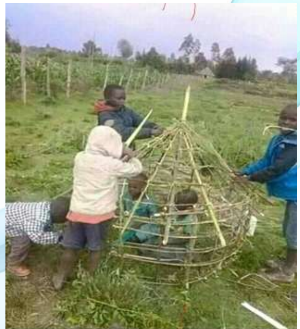
Potential Future Engineers exhibiting their construction skills during a Competency Based Curriculum(CBC) class.