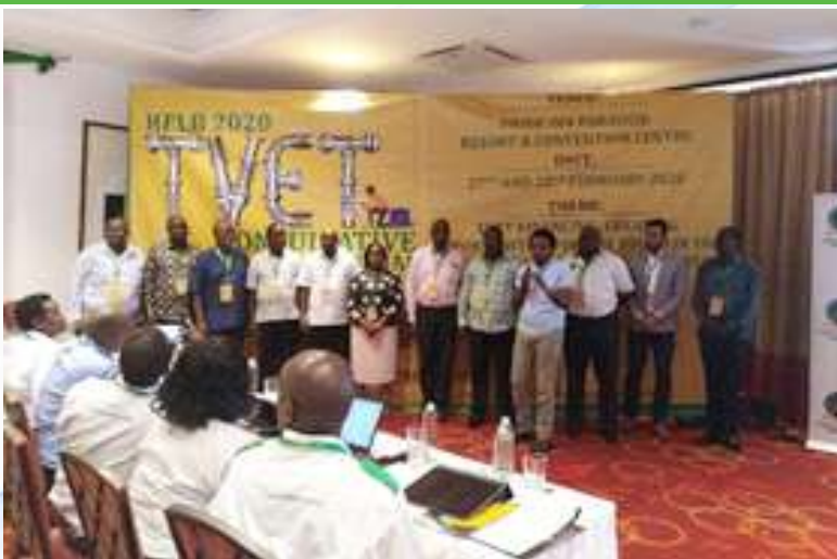
CAS- MOE, Hon. Zack Kinuthia addressing TVET Stakeholders' Consultative Forum on financing of Education and Training. The forum was hosted by HELB in collaboration with KNQA, TVETA, CDACC, KATTI among others at Pride Inn Hotel, Mombasa.