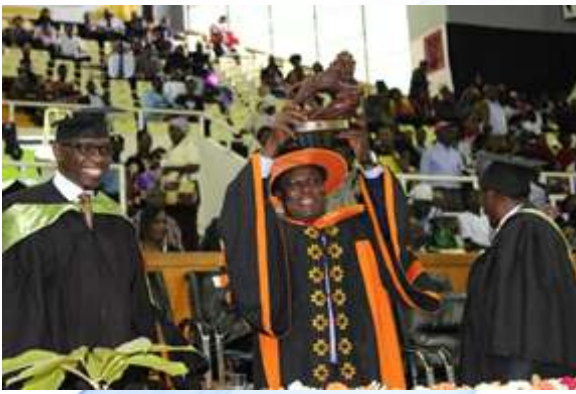
Director General KNQA officiating a graduation ceremony at the Kenya Institute of Management(KIM).