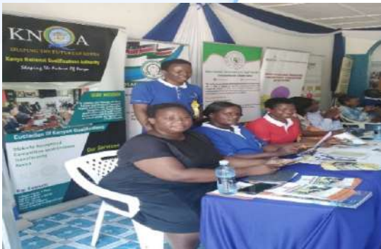
KNQA stand at the Agricultural Society of Kenya 2019 Show in Mombasa.