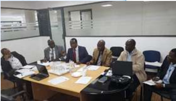
Planning meeting for the mainstreaming of Agricultural qualifications into the KNQF.