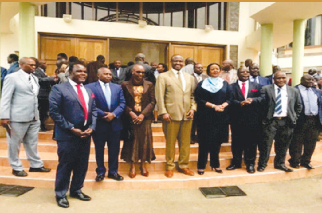
Former Council members during the launch of KNQF Regulations 2018.

In accordance with this law, no institution may award national qualifications unless it is recognized or accredited in accordance with the KNQF Act. The Framework sets out clear criteria for all qualifications and aims at developing and implementing a harmonized National Accreditation, Quality Assurance, Assessment and Examination systems to ensure that qualifications awarded meet the national standard.